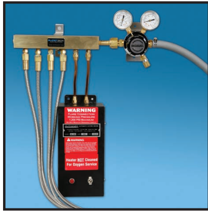
EA-6500 Multi Tank Heater Assembly