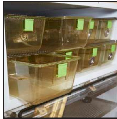
EA-1315 Shelf Divider Panels