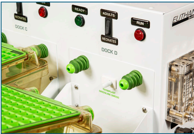
Each station is independently controlled