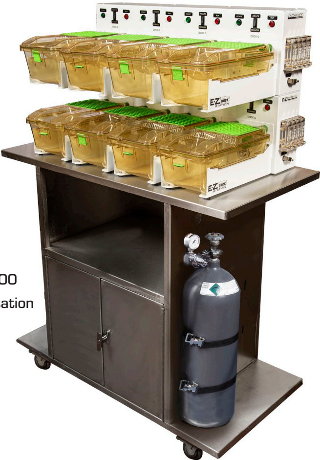
Fits our E-25000 Mobile Workstation

Input: 120-240VAC 1Amp Max @120VAC (per level) Max Pressure:100 PSI