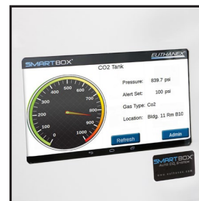
EA-300 Tank Talker