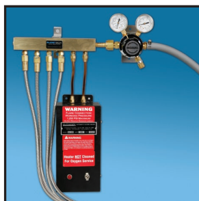
EA-6500 Multi Tank Heater Assembly