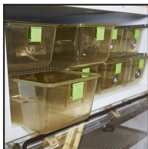
EA-1315 Shelf Divider Panels