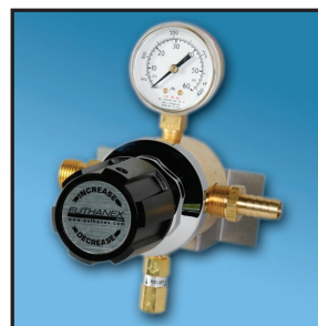
EA-255 Inline Regulator