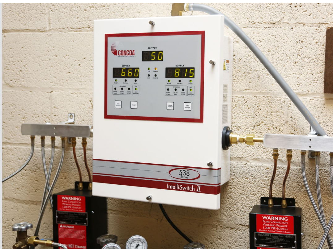
Multi Tank Manifold and Heater Assembly sold separately.