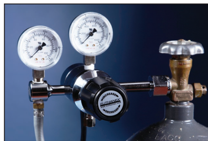
EA-550 Heated PSI Regulator