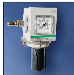
EP-IL60 Inline Regulator