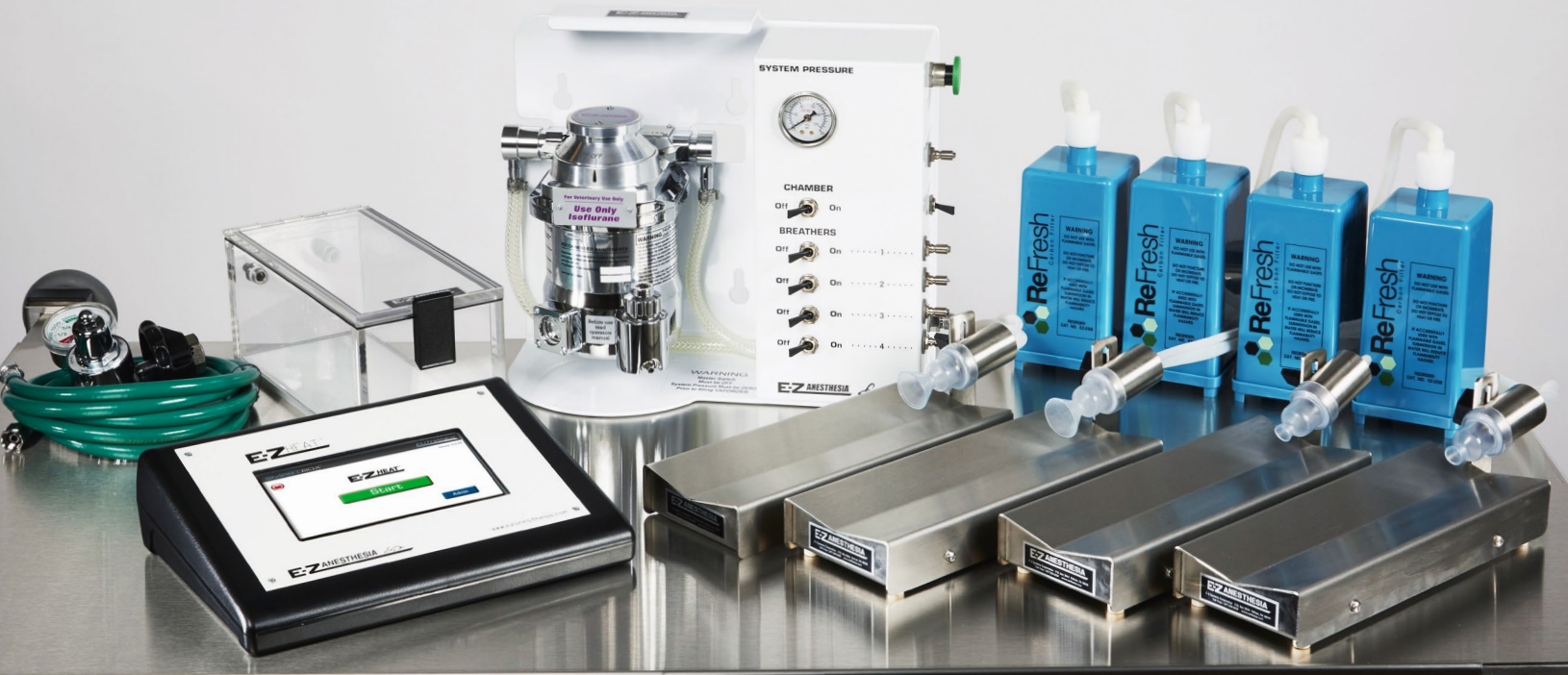
EZ-AF9000 - shown with E-Z Heat Controller and Heated Surgery Beds